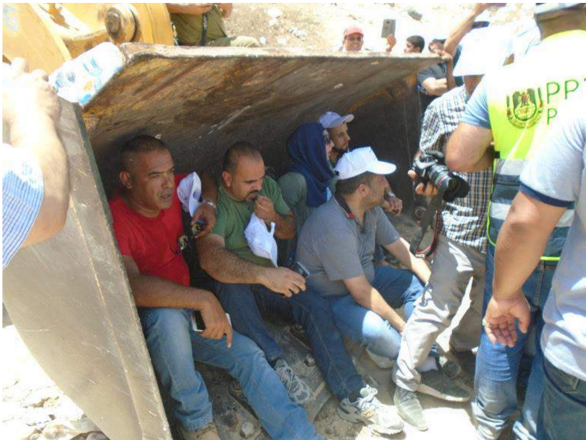
Palestinian protesters sit in the blade of an Israeli bulldozer at Khan al-Ahmar, a Bedouin village threatened with demolition. It is east of the Jewish settlement of Ma'ale Adumim on the road to Jericho and will take back more West Bank territory into direct Israeli control.

In 2015 the Dáil (Dublin parliament) passed a motion to 'officially recognise the state of Palestine on the basis of the 1949 borders with East Jerusalem as the capital, as established in UN resolutions.' This was intended as a further positive contribution to securing a negotiated two-state settlement to the Israeli-Palestinian conflict which many believe still continues to offer the best long-term political solution. However, with settlement expansion breaking up the territorial integrity of the West Bank there is increasing doubt about the viability of a two-state solution. Nonetheless, we believe that the Irish and British governments can and should recognise Palestine as an independent state, following the example of Sweden, rather than wait for unanimous EU agreement on this matter. The ultimate shape of the political structures in Israel and Palestine is for the people who live