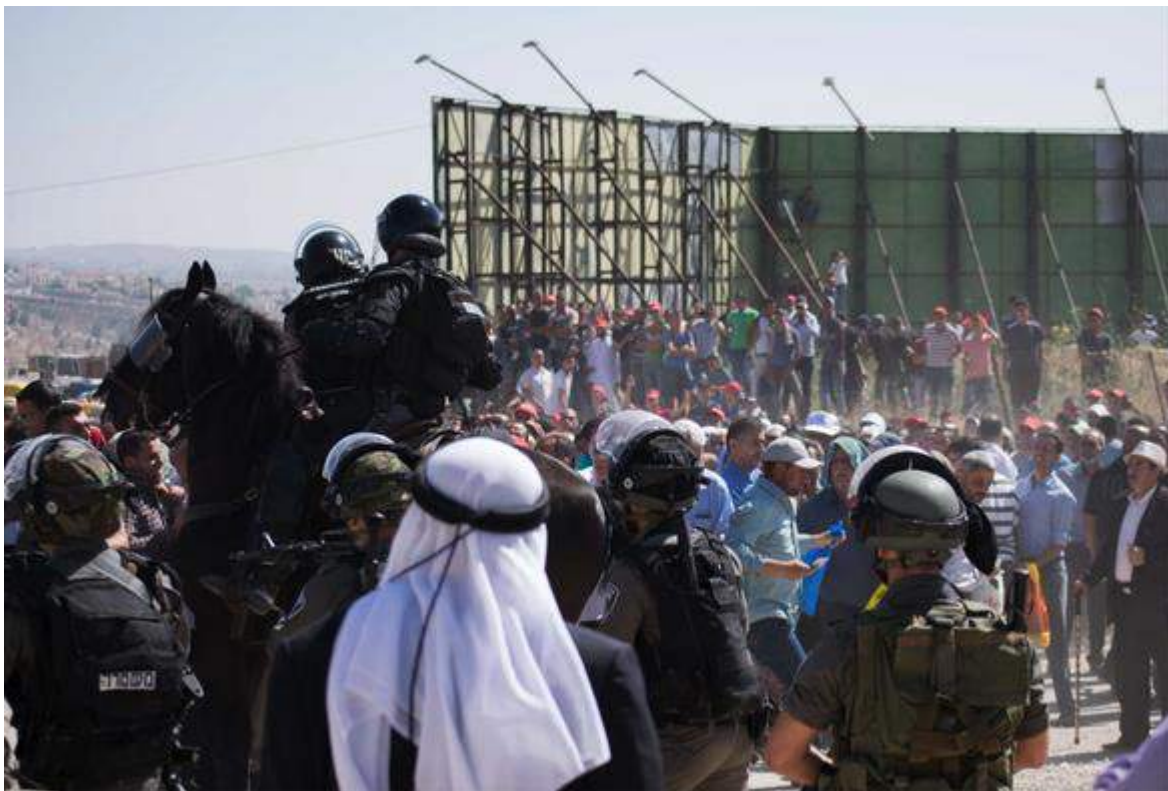
Mounted Israeli police ride into a Palestinian crowd trying to reach the Muslim Holy Places in Al Quds/Jerusalem during Ramadan 2016.

In the current situation of stalemate and where the Palestinians have been denied an avenue for exploring political solutions that could lead to negotiation, we believe the time has come for positive moral and political action by the Irish and British governments to revisit this catastrophe. Ireland has a significant leadership role to play as a small neutral state which can share the lessons of building a peace process over many years that finally achieved a historic negotiated agreement. Britain has the challenge of returning to the aims of the Balfour Declaration that promised respect for the rights of the Palestinian people alongside a homeland for the Jewish people.