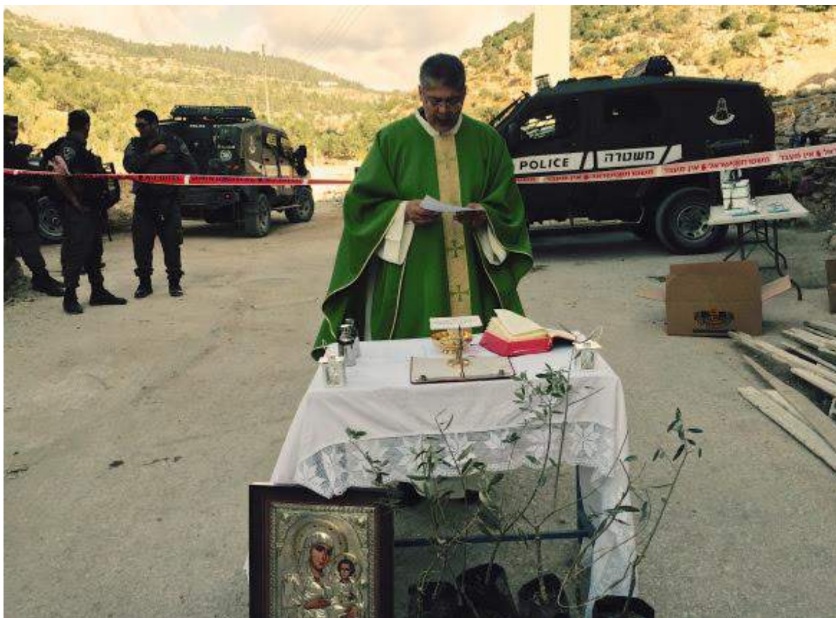
Eucharist being celebrated on the route of the Separation Barrier cutting Palestinian landowners off from their land.

Kairos Ireland is part of an international movement responding to a call for solidarity with Palestinians and action to end the occupation of Palestine by Israel. This call, made by Church leaders in Jerusalem, describes the occupation as 'a sin against God and humanity because it deprives the Palestinians of their basic human rights, bestowed by God. It distorts the image of God in the Israeli who has become an occupier just as it distorts this image in the Palestinian living under occupation.'