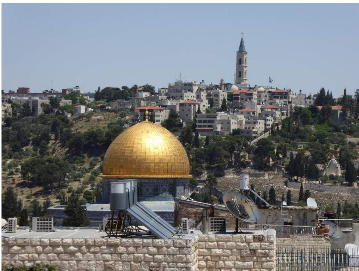
East Jerusalem - Dome of the Rock with the Palestinian neighbourhood of At Tur beyond. A large Israeli flag to the right of the Russian Orthodox Church of the Ascension marks a settlement house.

On 11 th July 2018 a private members bill sponsored by Senator Frances Black was debated in the Seanad (the Senate - upper chamber of the Irish parliament) and progressed to a second reading. The Control of Economic Activity (Occupied Territory) Bill 2018 aims to ban imports from illegal Israeli settlements that are built on stolen Palestinian land. This is a clear signal to Israel that international law must be upheld and that genuine peace can only come about when the party with overwhelming military power stops abusing that power. We hope that this Bill will offer a lead that other EU countries will follow. That the Israeli government has established a well-funded department to counter the effect of the BDS campaign is evidence of its effectiveness. Economic, cultural and sports measures need to be intensified in order to bring home to Israel the seriousness of the international community in opposing their apartheid policies.