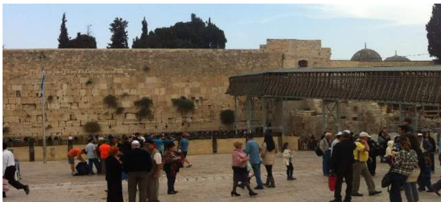
The Western Wall in the Old City of Jerusalem, constructed by Herod the Great c20-17 BCE, is the focus of Jewish prayer and pilgrimage

We note from the inclusive texts of the Old Testament, eg Genesis 12:3, that Abraham is blessed in order to be a blessing to all the families on earth and that strangers are to be honoured [ You shall not wrong or oppress a resident alien, for you were aliens in the land of Egypt ] (Exodus 22:21). In Ezekiel (Ezek 47:21-23) there was to be an equal distribution of the land between Jews and resident aliens, who were to be regarded as citizens of Israel. Leviticus (Lev 19:33-34) also emphasizes the point that aliens are to be equal citizens. The vision of the prophets (Isaiah 2:2-4 and Micah 4:1-4) is that Zion is a symbol for international peace and reconciliation. The Old Testament contains many different traditions that have been edited together by scholars with a variety of interests. While there certainly are exclusive texts, there are also eirenic and inclusive texts and it is the latter that are in accord with a Christian understanding of the scriptures.