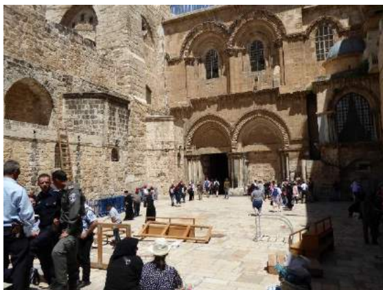
Entrance to the Church of the Holy Sepulchre

email – julian.hamilton@irishmethodist.org