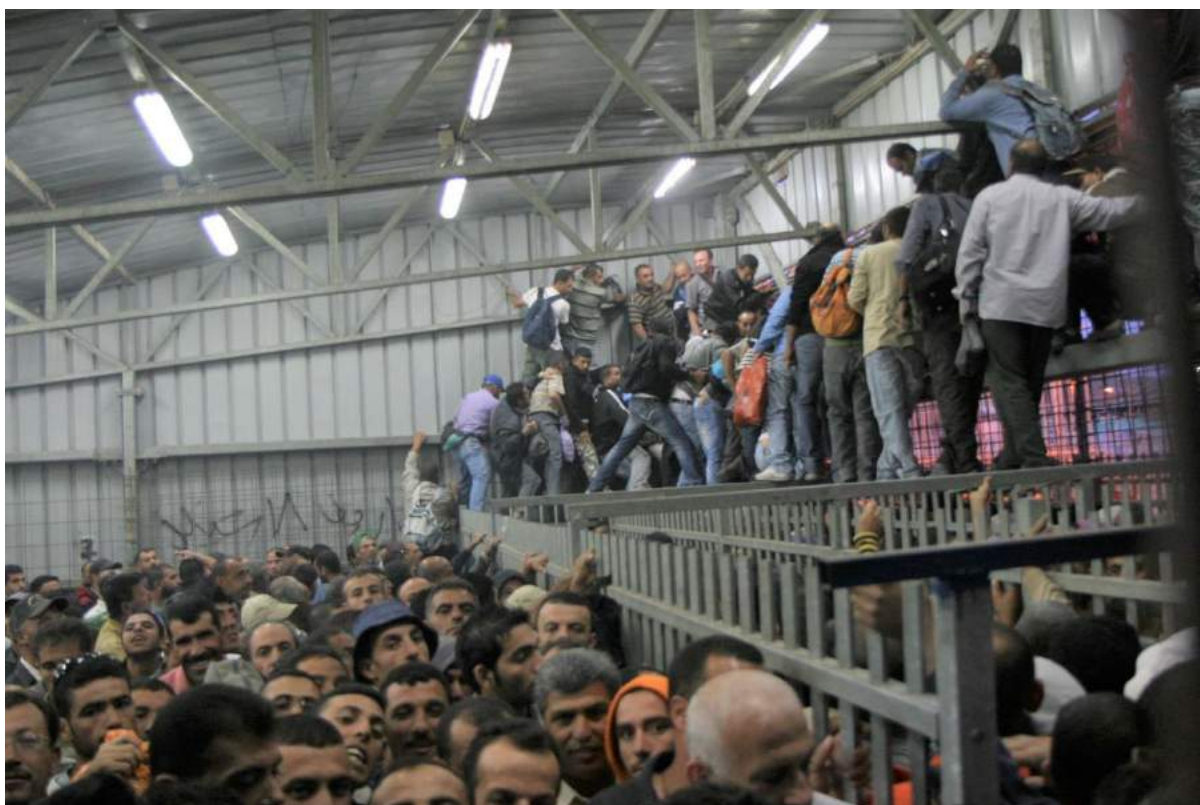
The early morning scene at Tarqumiya Check Point: West Bank Palestinians with work permits crowd through the barriers from 3am onwards in order to get to work in Israel.

This is in marked contrast to the declared intention from the declaration of the establishment of the state of Israel, which says that Israel will, 'ensure complete equality of social and political rights to all its inhabitants irrespective of religion, race or sex...' The declaration goes on to say that Israel will, 'guarantee freedom of religion, conscience, language, education, and culture; it will safeguard the Holy Places of all religions; and it will be faithful to the principles of the Charter of the United Nations'. These ideals have never been honoured by Israel but the promise of equality and respect for all the inhabitants is still shared by many Israelis today who are aghast at how quickly its own democracy is being undermined by the religious orthodox right wing.