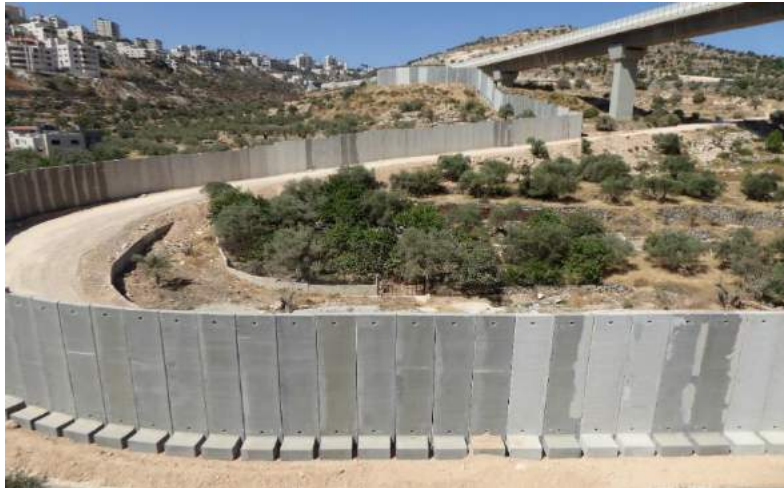
The Separation barrier cutting off Palestinian land in the Cremisan Valley (Beit Jala-Bethlehem). The flyover road was originally for settlers only but is now open to yellow plated (Israeli registered) cars.