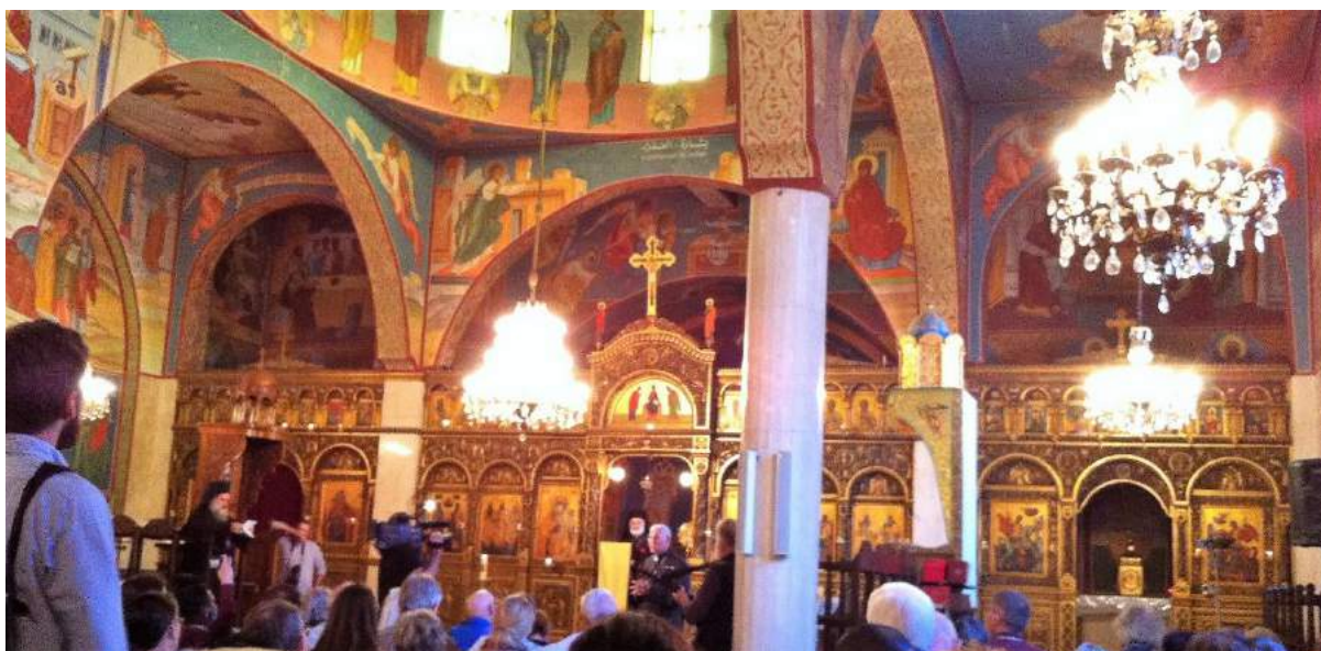
Greek Catholic Melkite Church in the Old City of Jerusalem