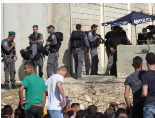
Israeli Border Police and Palestinian youth face each other at Qalandia Check Point – Ramadan 2016

International Women's Peace Service - http://iwps.info/ . Also offers short term delegations.