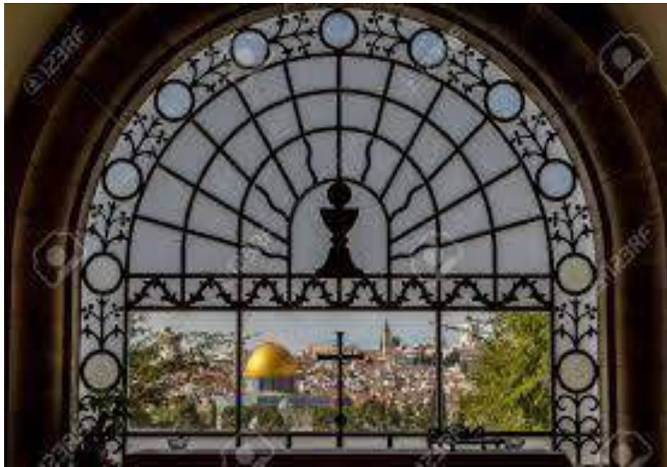
View from Dominus Flevit Church, Mount of Olives