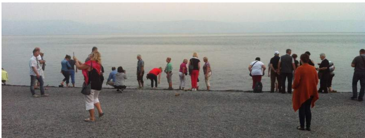
Pilgrims at Tabgha at the Sea of Galilee looking across to the Golan heights. This is beside the Church of the Multiplication where Jesus placed the five loaves and two fish on a rock turning it into an altar.

Many Catholic and Protestant church groups visit the 'Holy Land' each year as religious tourists. Palestinian Christians plead that such groups not only visit historic churches and archaeological sites but also encounter the 'living stones': Christian communities whose origins go back to the foundation of the Christian faith. To this end it is important that pilgrimage groups from Ireland stay in Bethlehem as well as in Jerusalem and visit other places in the West Bank such as Jericho, Nablus and Hebron, where the impact of a small number of extremist settlers on the lives of Palestinians is particularly acute. The economy of Bethlehem, a major Christian community, has been seriously impacted as tourism is reduced to day trips by coach from Jerusalem. Pilgrimage groups should resist attempts by the Israeli authorities to limit the time spent in Bethlehem to a few hours. We suggest that visiting groups should employ Palestinian tour guides and meet Palestinians, as well as using Israeli tour guides. If tourists have not had the opportunity to experience the daily reality of those who live there, and to see the 'separation barrier', the check points or the stolen Christian land in the beautiful Cremisan Valley then they have not had a full experience of Bethlehem.